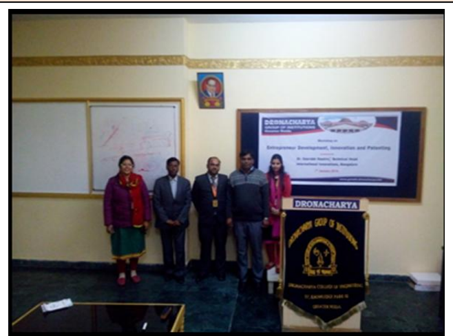
Faculty members at the event